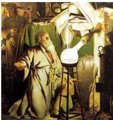
The Alchemist Discovering Phosphorus, by Derby 1771, Public Domain

Phosphorus is the 13th most abundant element in the earth's crust (0.099%), sandwiched between fluorine and manganese.