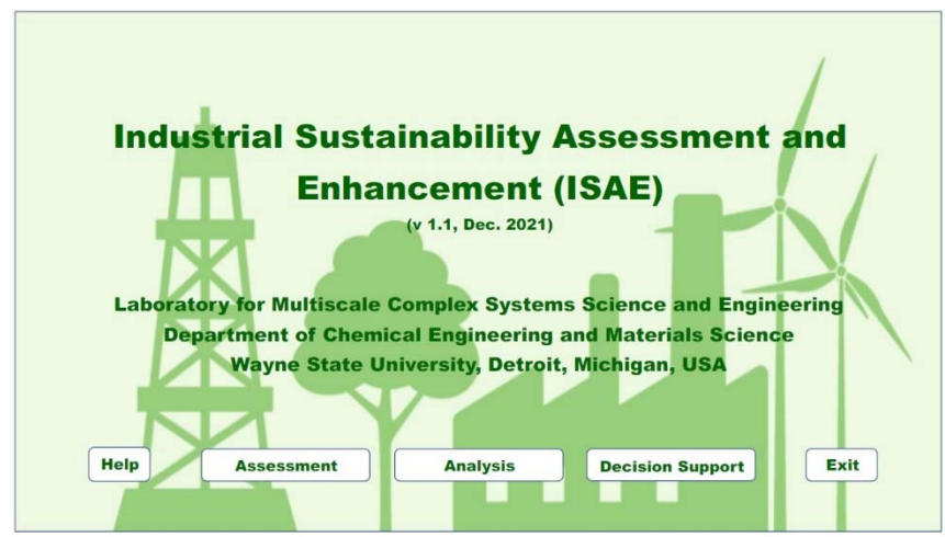
Figure 1 - Home screen design of the ISAE tool.

To assist industrial users in sustainability assessment, the PI's laboratory developed a software tool, named the Industrial Sustainability Evaluation and Enhancement (ISEE) tool in 2011 (Liu and Huang, 2011a,b). The tool had a limited function in terms of the type of sustainability indicators and the calculation method. However, that tool was MetLab based, with a flexible design and system structure for improvement. In this report period, we started to significantly improve it, with main financial support from an NSF-funded project. We have decided to include all the indicators we developed from this AESF project in the tool and to improve its assessment method. Figure 1 shows a design of the home screen of the tool, which is renamed the "Industrial Sustainability Assessment and Enhancement" (ISAE) tool. For this AESF project, we plan to complete its assessment and analysis functions, and use it to conduct a number of case studies on electroplating systems using different technologies.