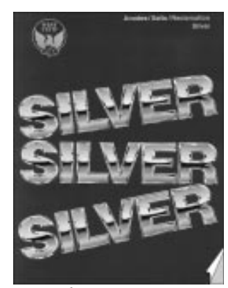
West Tech, Inc.

PTFE Additives: Literature on Polymist®/Algoflon® PTFE lubricant additives features typical applications and property data. The seven-page brochure includes full-color particle size distribution charts and scanning electron microscopy photos of all PTFE additive grades. These PTFE powders are designed for use as additives in coatings where narrow particle size distribution is required, and for improved release, mar resistance, slip, chemical resistance, weatherability and moisture repelling. Ausimont, 10 Leonards Lane, Thorofare, NJ 08086.