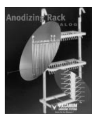
Vulcanium Anodizing Systems