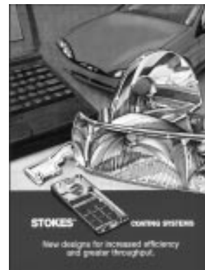
Stokes Vacuum Inc.

A series of "How To" brochures provides detailed information on the se-