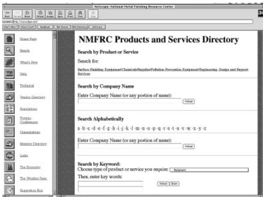
Fig. 2—Directory of products and services.

connected to the Resource Center to interface with other users. Any questions or information that are posted in a conference are automatically entered in a conference database. When users enter the conference area of the Website, they are directed