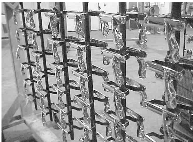
Large plating racks are used on Reliable Plating Works' automated lines.

Brilliance LLC currently represents five finishing companies, collectively taking care of their health and dental insurance, business and workers compensation insurance, marketing, lease programs, human resources, safety issues, and employee training. Brilliance represents more than