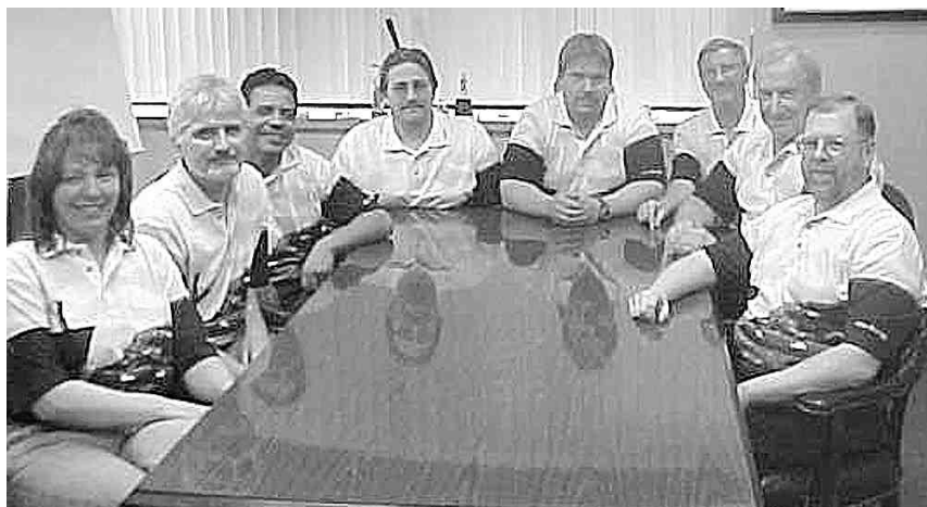
The management team from Reliable Plating Works shown at a recent meeting at the shop.

Getting involved and staying involved on a local, state and federal level can produce significant rewards for finishers. P&SF