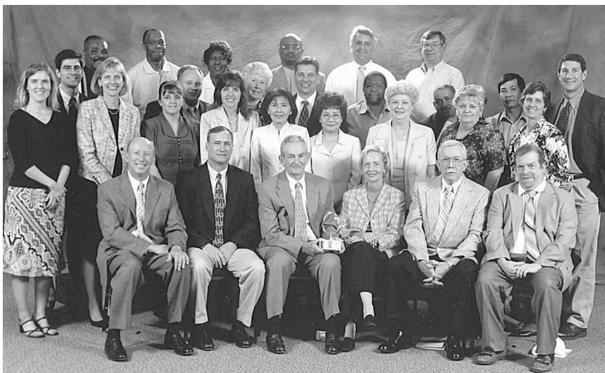
A group of Dixie Industrial Finishing's "family" pose with the "Manufacturer of the Year" award.

Establishing sound workplace principles, promoting community involvement and keeping abreast of local, state and federal regulations is paying dividends for RPW and Elite Finishing. Not only are the two job shops prospering, RPW was