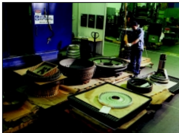
A variety of typical jet engine parts that will be washed in the large parts washer.

expected life from 15 to 25 or more years. Mild steel washers are subject to corrosion. Because deionized water and some cleaning formulations accelerate corrosion of mild steel, use of stainless offers greater serviceability of equipment and more flexibility in the choice of cost-effective cleaning agents.