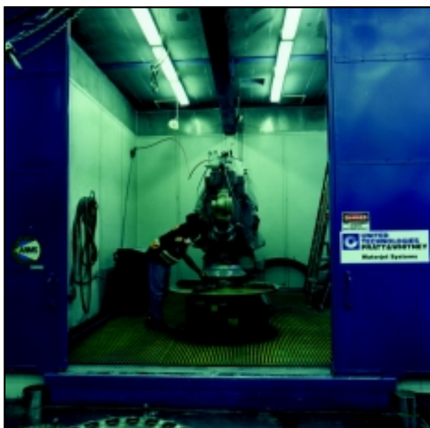
This computer-controlled, closed system delivers waterjet pressure of 55,000 psi, making it an effective method for removing the more impervious coatings.

For durability, the entire parts washer is constructed of stainless steel, as is all support equipment. The specification of stainless steel should increase the washer's