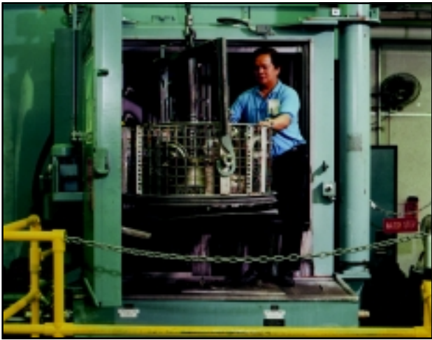
Component parts are being loaded into the smaller parts washer.