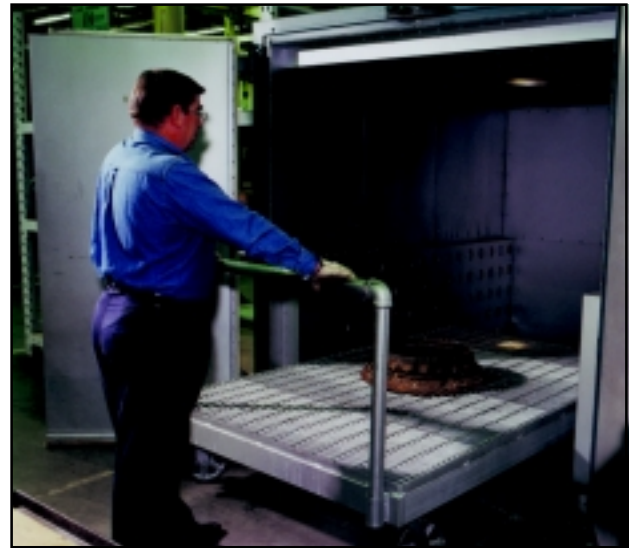
A walk-in drying oven is used in conjunction with the large parts washer.

For best results, the aqueous cleaning chemicals are used that meet the standards set by ARP 1775B and are