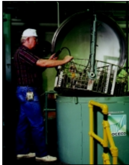
Parts removed from the components parts washer are loaded into the vacuum dryer.

With aqueous cleaning, there is no hazardous waste to dispose. The water from the wash and rinse tanks at UAL is directed into an industrial drain line and treated in the company's water treatment plant on site.