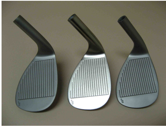
Photograph 2 – Three golf clubs coated with (left) a 0.001” thick under layer of high phosphorous electroless nickel followed by 0.001” thickness of a composite electroless nickel and diamond coating; (center) 0.001” thickness of a composite electroless nickel and diamond coating over coated with a 0.0002” thick layer of medium phosphorous electroless nickel; and (right) a single layer of 0.001” thickness of a composite electroless nickel and diamond coating

The appearance of composite electroless coatings with diamond or silicon carbide is an attractive matte gray. Many end users actually prefer this color for its unique and distinguishing appearance. See Photograph 2 of three parts coated with a composite electroless nickel-diamond coating. Of course appearance of the coating is usually not relevant in wear applications, and only performance is the relevant property. And in situations where a bright appearance like conventional electroless nickel is desired, it is simple to apply a thin overcoat of conventional electroless nickel over the composite coating. An overcoat as thin as five microns easily accomplishes this surface modification, as can be seen in Photograph 2. Moreover, as a composite electroless coating is hard metal material, it is possible to finish it in a wide variety of ways including all types of plating, painting, powder coating, blasting, tumbling, polishing, and so on.