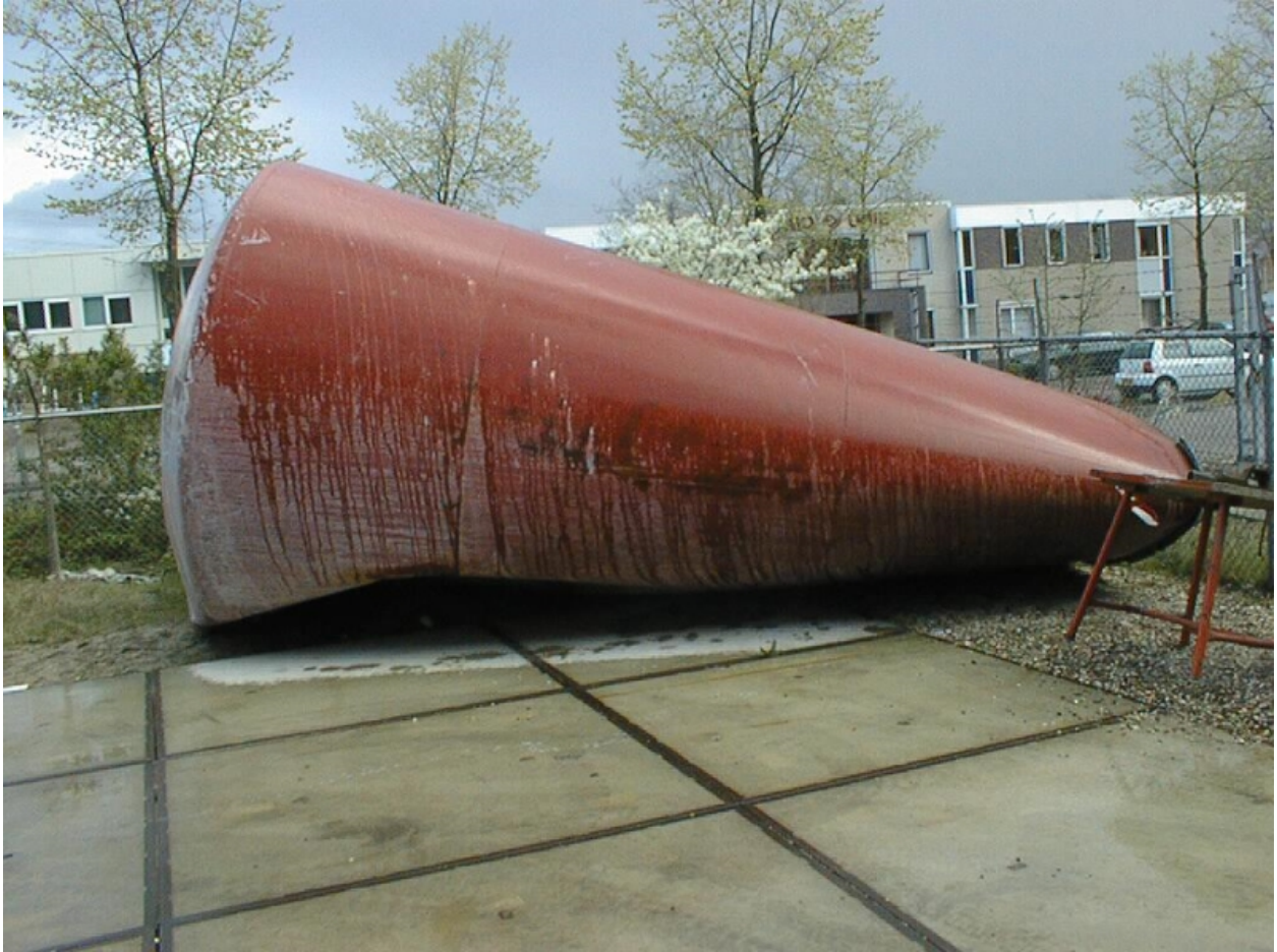
Tank "rocket" – approx. 15' tall X 12' diameter

In conclusion, please learn from the suffering experiences and catastrophic failures of others; be wiser from their losses and not your own.