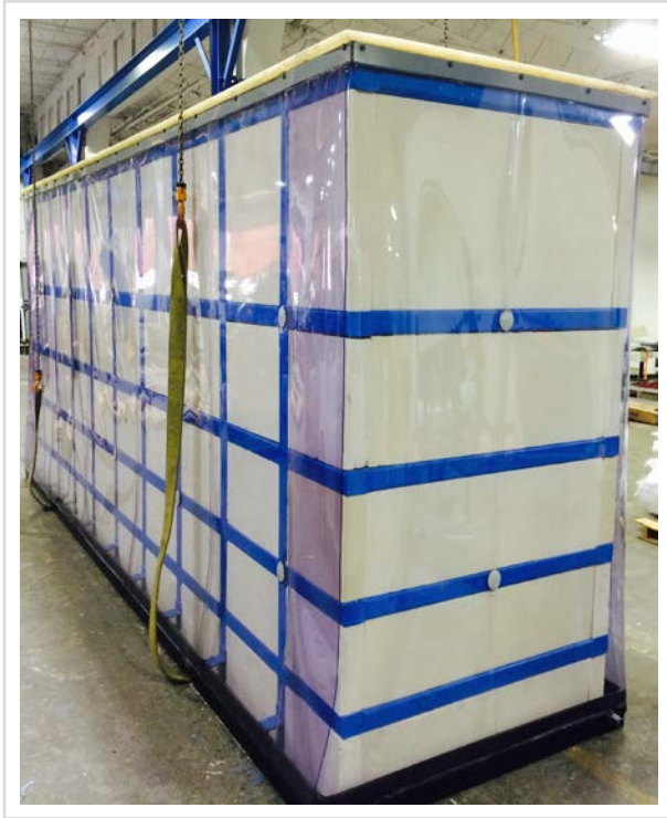
PPL tank with steel structure, insulation and clear vinyl protection