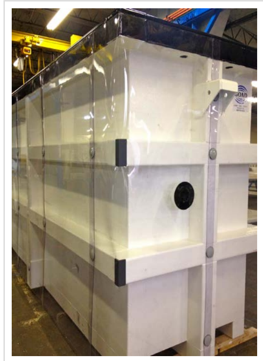
Carbon Steel Lined Tank with 100% sealed clear vinyl exterior protection