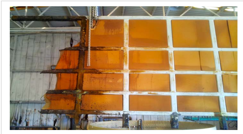
“Hidden” corrosion under the encapsulated polypropylene caused this catastrophic failure/tank wall “blow out”.

In one instance, a well built, 7-year old polypropylene tank which had NEVER leaked, experienced a side wall “blow out” due to hidden structural steel corrosion from acid drips at the tank’s top rim. A fume collection hood was mounted on the tank rim and the plastic encapsulating the steel structure was evidently compromised. Hot fumes will condense to liquid and even extremely slow drips will create gallons of acid over time. One drip per minute = one gallon per week (364 gallons over 7 years), so even one drip per hour over 7 years would create 6 gallons of acid. In this case, the actual quantity to dissolve the steel is irrelevant, as whatever it was, the steel was fully corroded away.